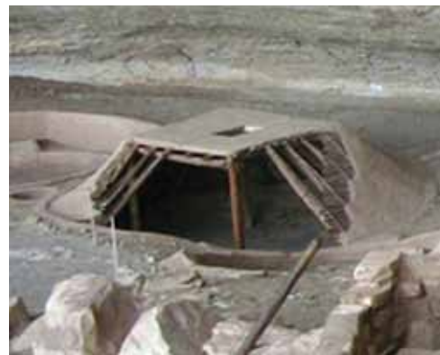
Figure 3. Contaminated site

Figures 3 and 4 show a successful brownfield site decontamination in Austin, and its conversion into an environmentally friendly residential building, characterized by extensive use of renewable sources of energy.