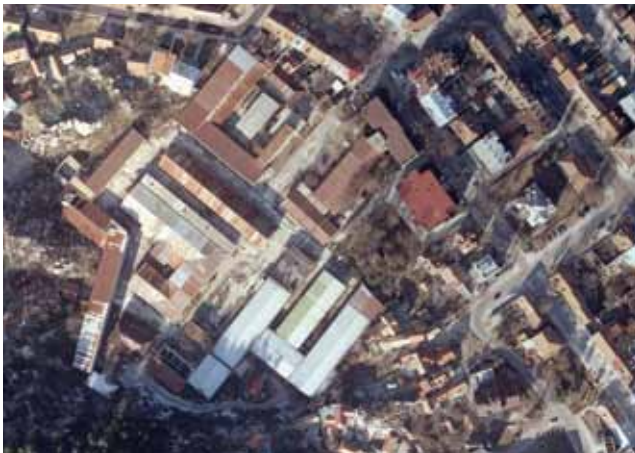
Figure 6. Brownfield- industrial zone "Stari Obod"- existing situation

In the context of sustainable urban development of cities, an increasing interest has been expressed over the last decade in managing the quality of living environment. Two highly significant international architectural competitions for brownfield regeneration were held in Montenegro in 2008 and 2009. In Cetinje, the area of "Stari Obod" is to be converted into the University of Arts (Faculty of Fine Arts, Music and Drama, Figures 6, 7 and 8), while in Mojkovac the "Jalovište" site is to become a sports and recreation centre. The Jalovište site in Mojkovac was one of the most contaminated sites in Montenegro with the highest levels of environmental risk. In 2008 and 2009, it was remedied in several stages, and according to present day estimates, it has been successfully decontaminated. The term "brownfield" is very rarely used in Montenegro, and the relationship towards critical areas in cities has not reached a level that would require sustainable urban regeneration and sustainable local development.