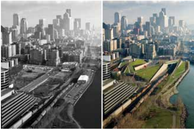
Figure 1. Transforming an urban brownfield, reconnects Seattle to the waterfront, Seattle, U.S. 2009

Figures 1 and 2 show a successful revitalization of an industrial district in Seattle, connection of the city to the coast through creation of a new art-prone landscape, and construction of the Museum of Arts and the Olympic Sculpture Park, where new forms of art, environment and urban construction have been developed.