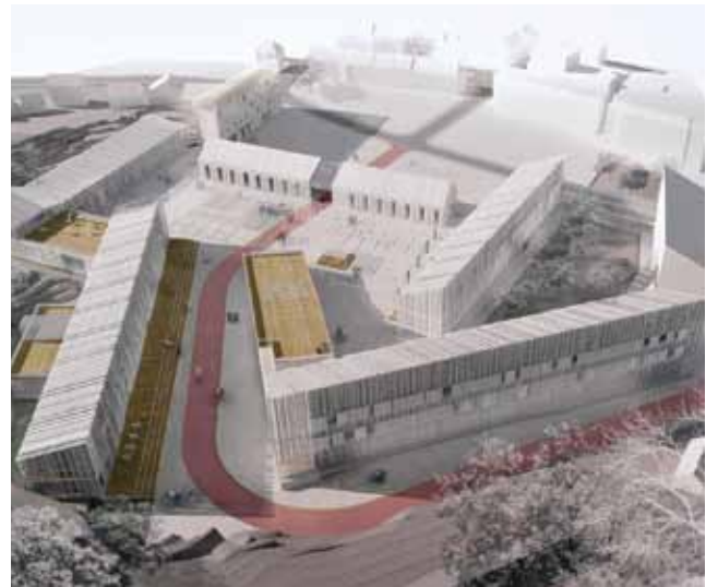
Figure 8. Brownfield regeneration: First Award architectural competition entry for urban complex in Cetinje, 2009

In Montenegro and in surrounding countries, practical brownfield problems are mostly solved at the local community level. There is still no strong and clear strategy and management platform at the state level that would encourage significant investment in brownfields and promote urban regeneration and sustainable development. In other places, e.g. in Serbia [36, 37] and in Croatia, [38, 39, 40], some authors who have dealt with brownfield issues from scientific standpoint point out that more energy should be invested in the treatment of this problem and in strengthening public-private partnerships and brownfield investment strategies, which should be regarded as important links in the sustainable development of cities.