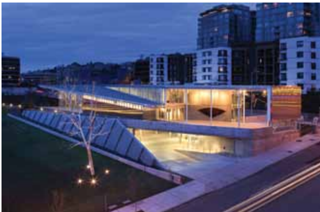
Figure 2. Art Museum and Olympic Sculpture Park, Seattle, U. S., 2009

The EPA has identified some key elements in sustainable brownfield restoration, such as community profiling, community planning, organizational structure, risk management, legal issues, marketing, technological aspects, project financing, etc. [11].